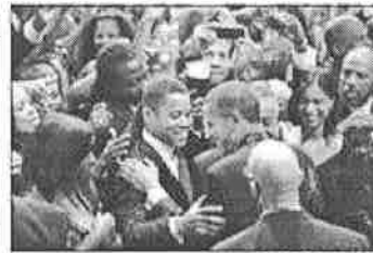
President Barack Obama speaks with U.S. soldiers at the 100th anniversary of the end of slavery in Washington, D.C.

President Barack Obama urged African Americans to fight for their country and to support the military during a speech in Washington, D.C., on Monday. Obama said that the military is the backbone of the nation and that African Americans have a long history of service. He called on them to continue to serve and to support the troops who are currently deployed in Iraq and Afghanistan.